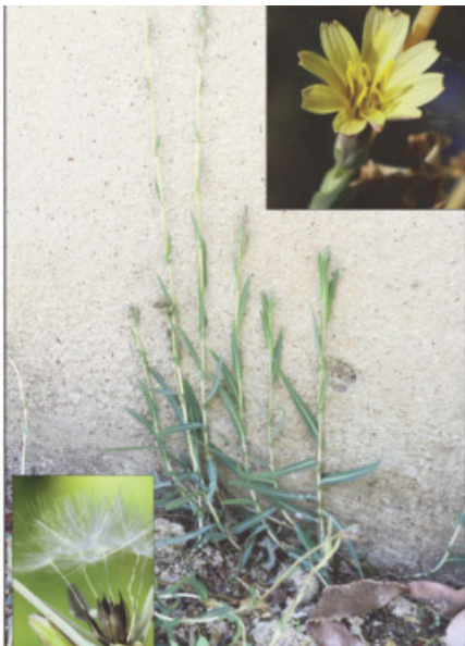
Fig. 3. Lactuca saligna , Xewkija (close to Ulysses Grove), Gozo (7-Oct-2018).

Out of interest, Sommier & Caruana Gatto (1915) and Borg (1927) give the impression that L. serriola and L. virosa were scarce or infrequent in Malta, where they only give and a handful of localities in their flora. In contrast, the current distribution of L. serriola is widespread throughout the Maltese Islands (Fig. 1) and this divergence raises doubts if this species was introduced in Malta around the end of the 19 th century and flourished during the last 100 years.