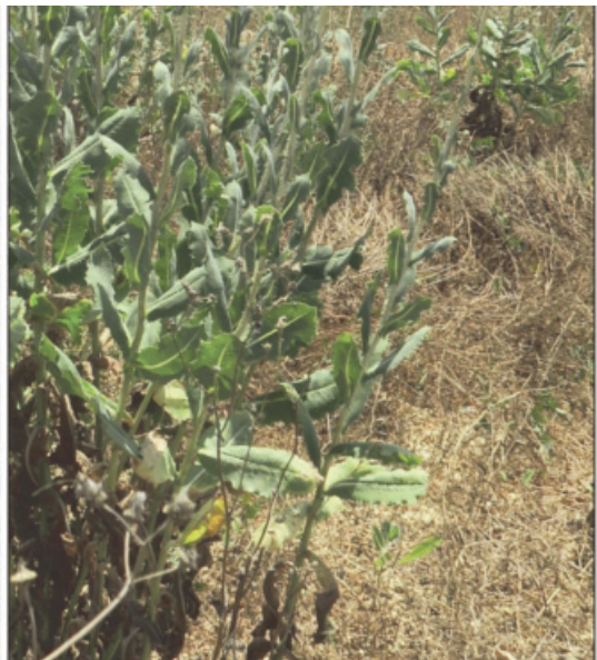
Fig. 4. Lactuca serriola with entire leaves where it was previously referred to as f. integrifolia and sometimes misidentified as L. virosa . (specimen L41, Qala, Gozo).