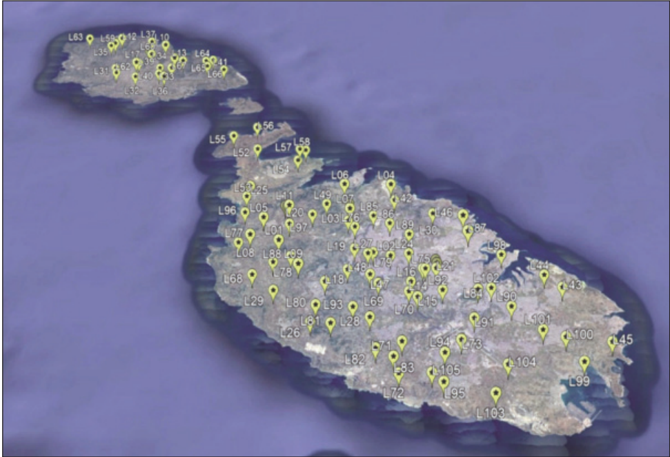
Fig. 1. Map showing location of collected specimens.