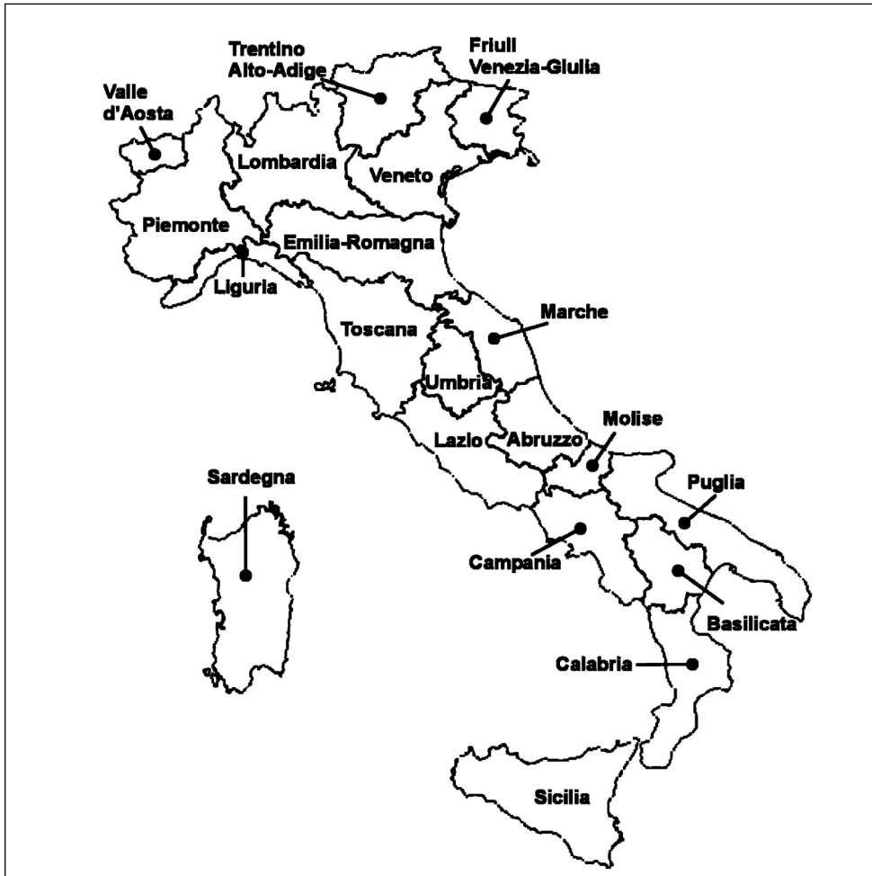
Fig. 1. The 20 Italian administrative regions.