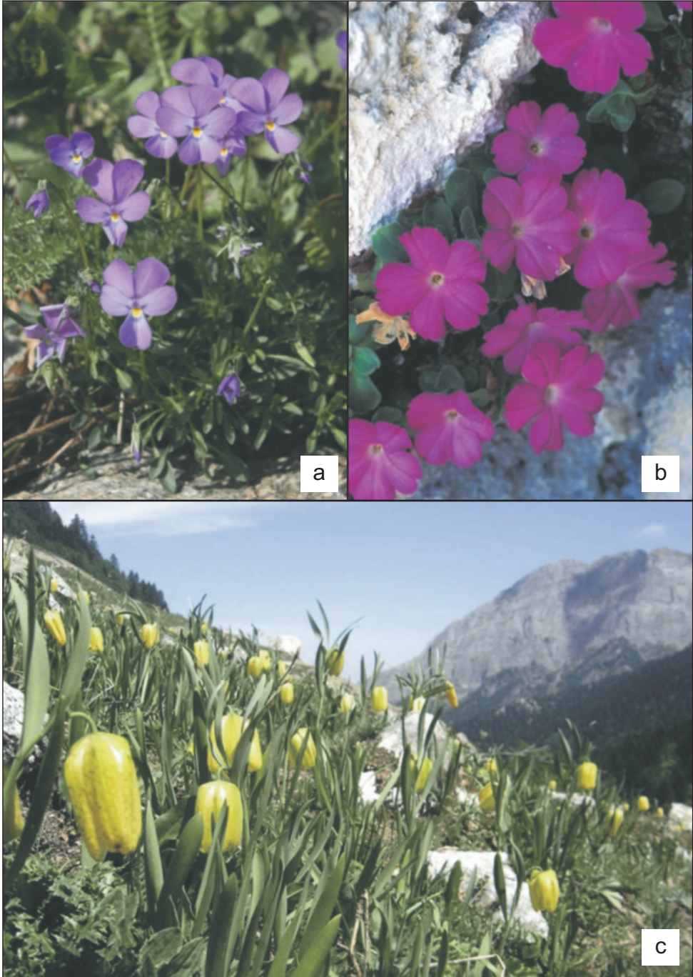
Fig. 3. a) Viola valderia and b) Primula allionii in the Maritime Alps; Fritillaria tubaeformis subsp. moggridgei in the Maritime Alps