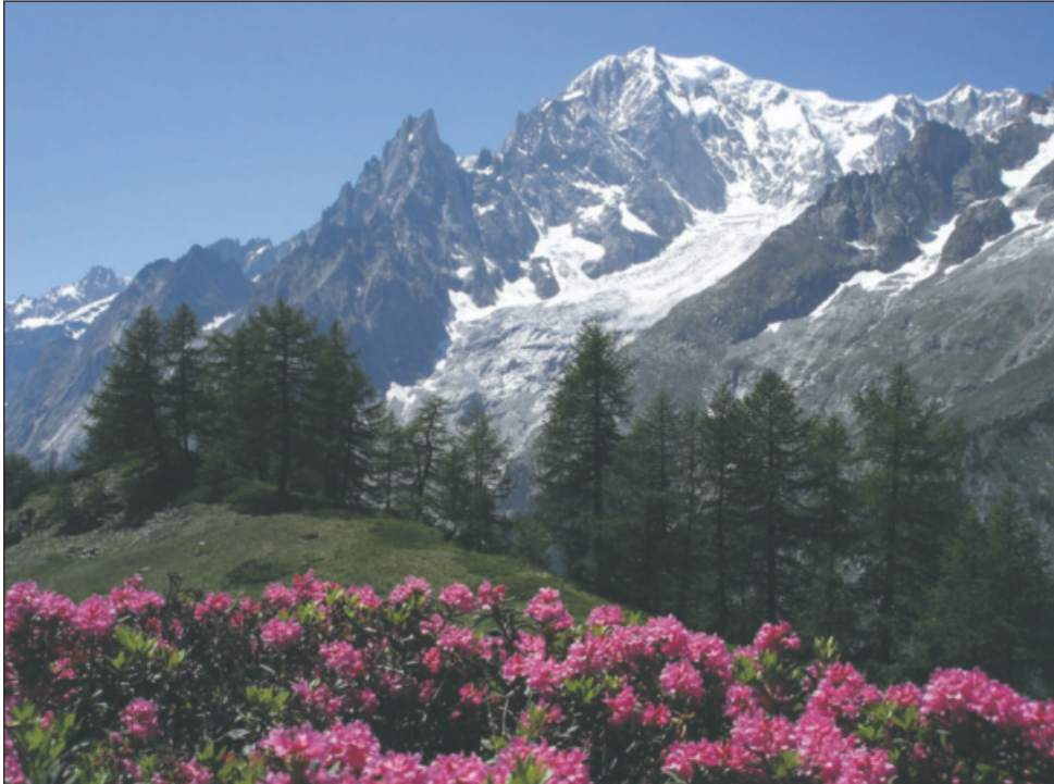
Fig. 1. The Mont Blanc seen from Mont La Saxe (Photo Siniscalco).

tion in climate-induced biotic change is occurring even in remote places on Earth, with potentially far-ranging consequences not only for biodiversity, but also for ecosystem functioning and services.