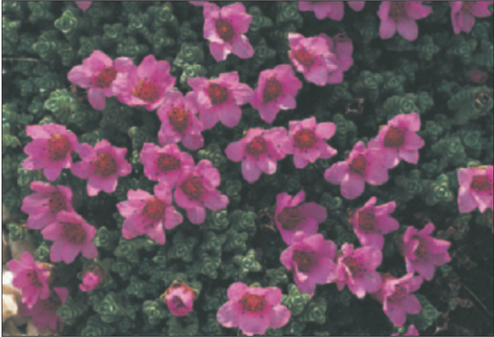
Fig. 5. Saxifraga oppositifolia subsp. speciosa.

pyramidalis (L.) Rich. and other species that very interestingly vicariate the Susa Valley ones, as Eryngium amethystinum L. at the place of Eryngium campestre L., Trinia dalechampii (Ten.) Janch. at the place of Trinia glauca (L.) Dumort.