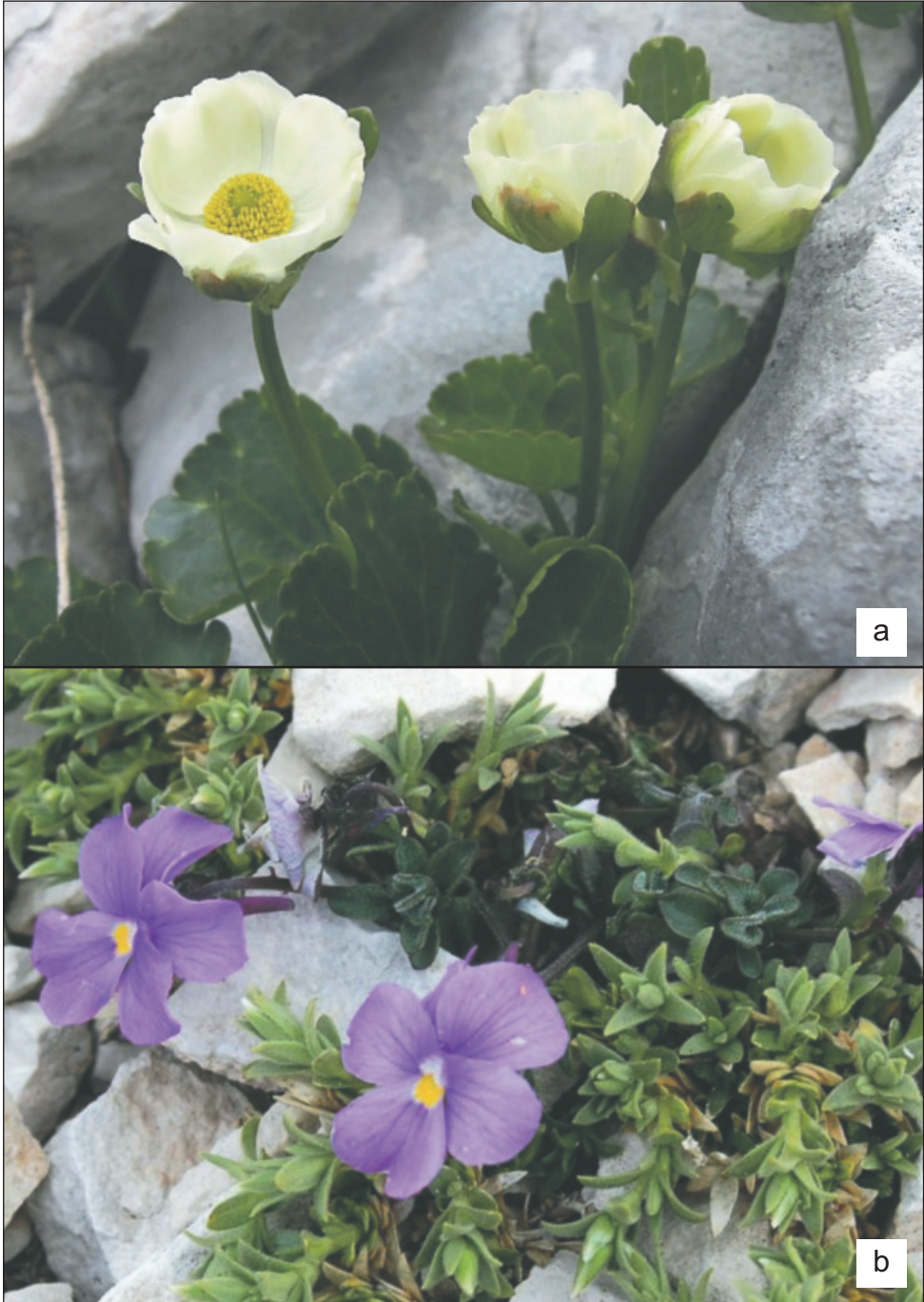
Fig. 4. a) Ranunculus magellensis in Majella (Photo Nicolella); b) Fig. 13. Viola magellensis in Majella (Photo Nicolella).