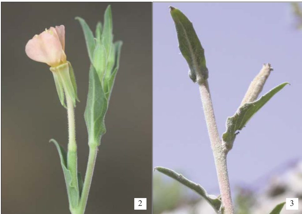
Fig. 2-3. Flowering and fruited branch of Oenothera indecora .

Flowering time: September-July in Brazil; September-May in Uruguay, Paraguay and Argentina (Dietrich 1977).