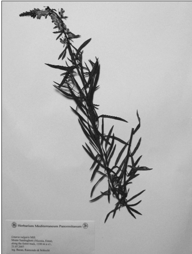
Fig. 2. Linaria vulgaris : the specimen from Mt. Sambughetti.