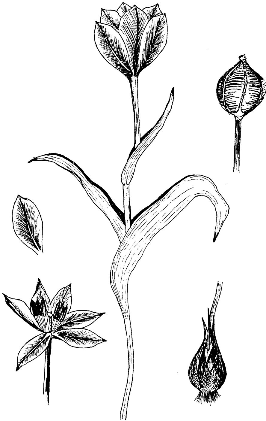
Fig. 1. Tulipa serbica , general habit and details. – Drawn from a plant of the type collection.